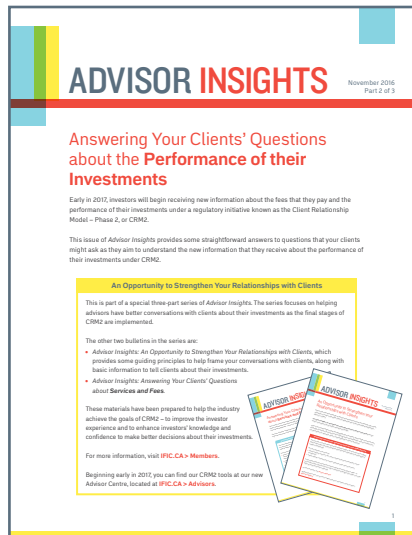
Advisor Insights: Answering Your Clients' Questions about the Performance of their Investments