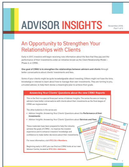
Advisor Insights: An Opportunity to Strengthen Your Relationships with Clients

The purpose of CRM2 is to increase investor knowledge and engagement. In doing so, it will create opportunities for advisors to strengthen client-relationships through better conversations about fees and performance. For tips and insights in how to discuss the content of the new reports with your clients, take a look at these recent publications: